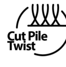
Cut Pile Twist