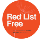
Declare® Red List Free