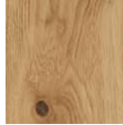
500 Alpine Oak