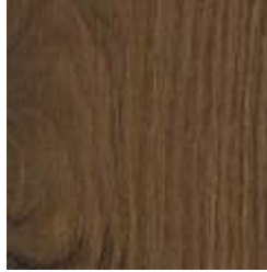
190 Costa Brava