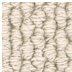
1 Cotswold Stone