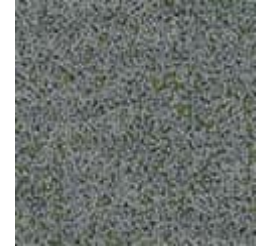
936 Fresh Paint