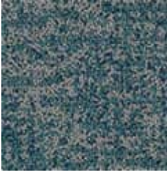
535 Flow State