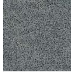
935 Creative Soul