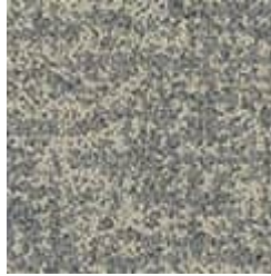
729 True Self