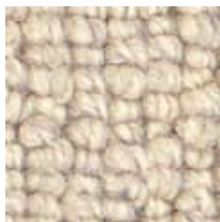
10 Sarsen Stone