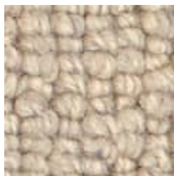
11 Druid Stone