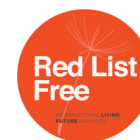
Declare® Red List Free