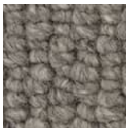
96 Earth Bank