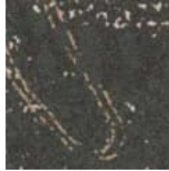
760 Smokey Quartz