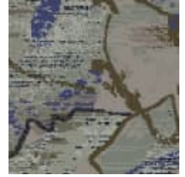
2021 25 D