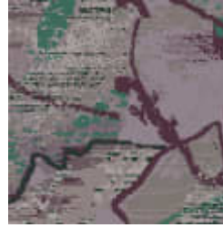
2021 25 C