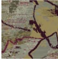
2021 25 F