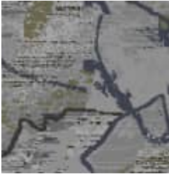
2021 25 E