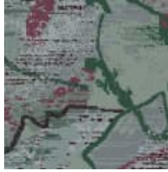
2021 25 B