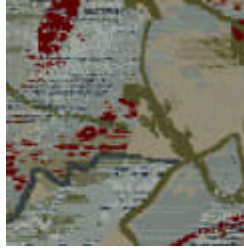
2021 25 A