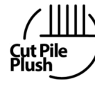
Cut Pile Plush