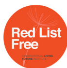
Declare® Red List Free