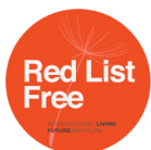
Declare® Red List Free