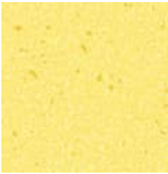
350 Crystal T54 LRV 55 PR: W 100 x L 100cm PTS: All-over