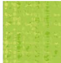
910 Ombra T20 LRV 37 PR: W 100 x L 100cm PTS: All-over