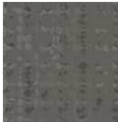
790 Ombra T97 LRV 16 PR: W 100 x L 100cm PTS: All-over