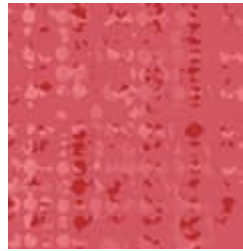
620 Ombra T15 LRV 18 PR: W 100 x L 100cm PTS: All-over