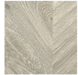
720 Olympus T91 LRV 33 PR: W 100 x L 150cm PTS: W (4x25) x L150 cm