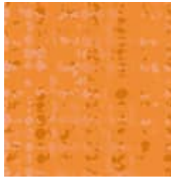
380 Ombra T65 LRV 462 PR: W 100 x L 100cm PTS: All-over