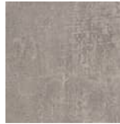
710 Pinnacles T83 LRV 28 PR: W 100 x L 100cm PTS: All-over