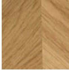
310 Natural Oak Brush