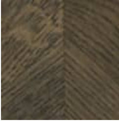
180 Coffee Oak