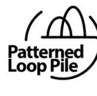
Patterned Loop Pile