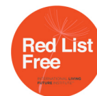
Declare® Red List Free