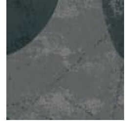
2021 119 L