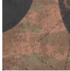
2021 119 C