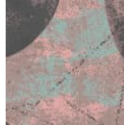
2021 119 D