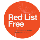
Declare® Red List Free