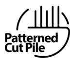
Patterned Cut Pile