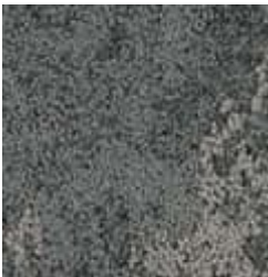
937 Map Rock Stone