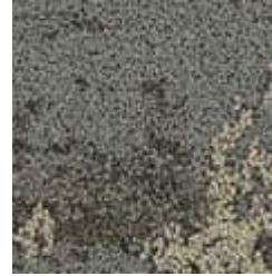
847 Velvet Snow Bark