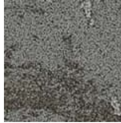
837 Moonglow Bark