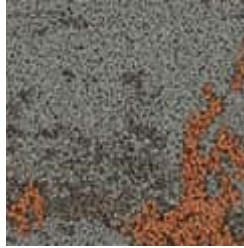
832 Sunburst Bark