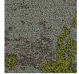
856 Jewel Leaf Bark