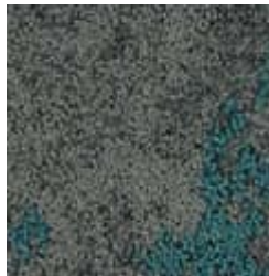
945 Sky Shield Stone