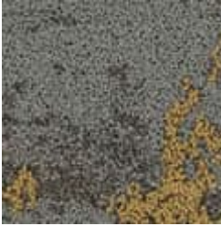
831 Gold Dust Bark