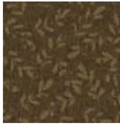
3900 Golden Elm