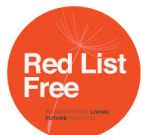
Declare® Red List Free