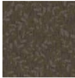
5800 White Oak