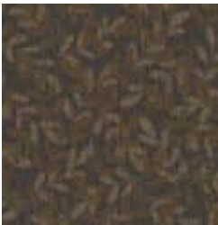
8500 Blue Haze