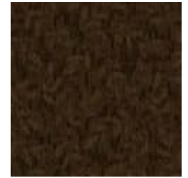
8300 Autumn Blue