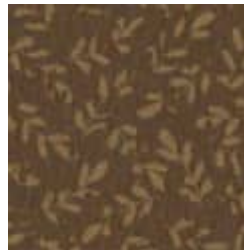
9500 Fallen Leaves