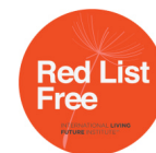
Declare® Red List Free