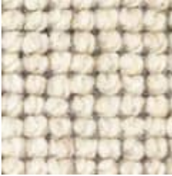
536 Sandy Shore