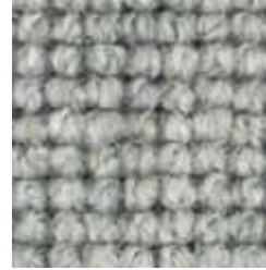
725 Light Metal