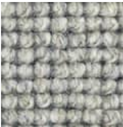
740 Winter Solstice