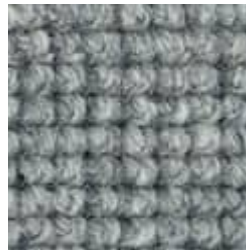
745 Evening Dusk