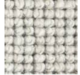
735 Clay Stone