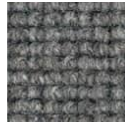
770 Coal Face