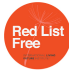
Declare® Red List Free