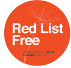
Declare® Red List Free