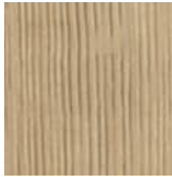
140 Umbra Oak