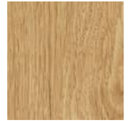
380 Truncus Oak 449