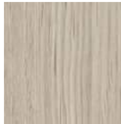
740 Genero Oak 950