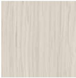
120 Genero Oak 125