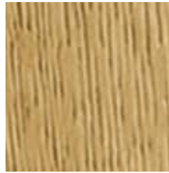
300 Vallem Oak