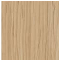
540 Genero Oak 857