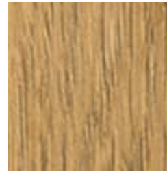
340 Sedato Oak