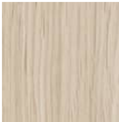
500 Genero Oak 247