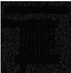
792 Occupation - Printers' Ink