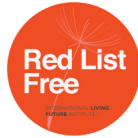
Declare® Red List Free