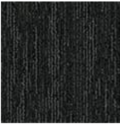
93 Nocturnal II - Night Shadow