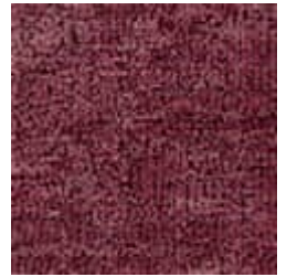
354 Magenta Haze