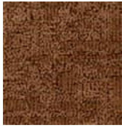
252 Magic Touch