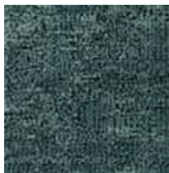
566 Just For A Thrill