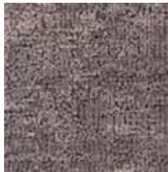
424 La Vie En Rose