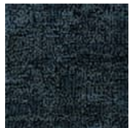
595 Kozmic Blues