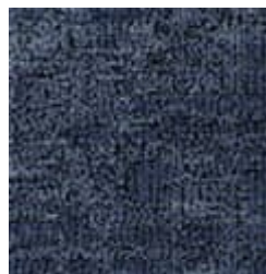
584 Kind Of Blue