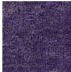
454 Purple Rain