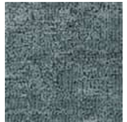
535 Blue Skies