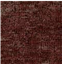
373 Love Tko