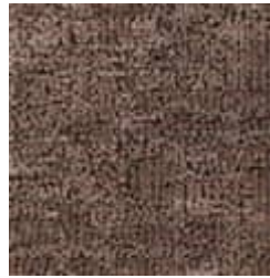
353 Spell On You