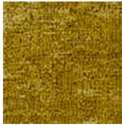
151 Sunny Side