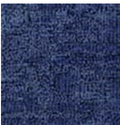
555 Blueberry Hill