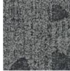
949 Easy Breezy