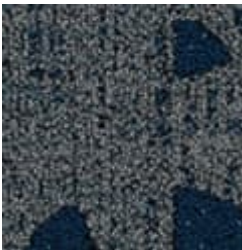
965 Blue Bliss