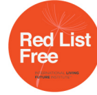
Declare® Red List Free