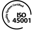
ISO 45001 OHS Management System