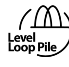
Level Loop Pile