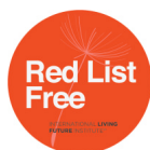
Declare® Red List Free