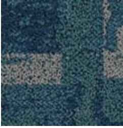
535 Flow State