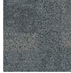
935 Creative Soul