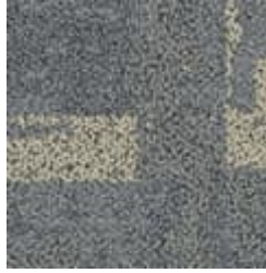
729 True Self