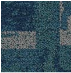
535 Flow State