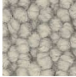
520 Buckley Falls