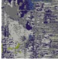
2021 23 C