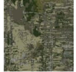
2021 23 F