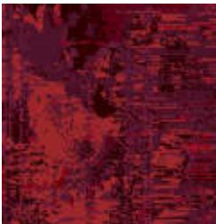
2021 23 G