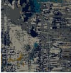
2021 23 A