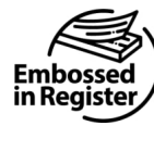
Embossed in Register