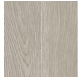
700 Etta May