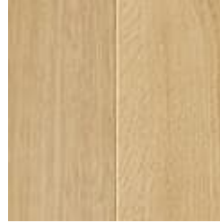
300 Olivia Rose